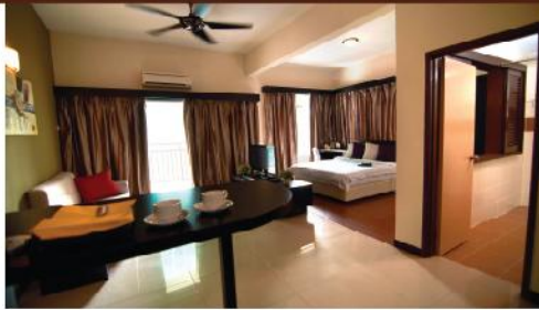
Studio Room with jacuzzi