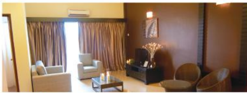
2 or 3 Bedrooms apartment